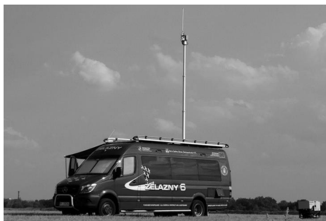
Fig. 2. Mobile Controller ASSD+PL

Measuring modules operate autonomously. It means that calculations are not made based on data delivered by systems and devices being part of the aircraft. Generated data are transmitted by radio to the Mobile Controller ASSD+PL, presented in Fig. 2, where they are processed. In the simplified solution, the vehicle with a specialised equipment may be replaced by a small base station.