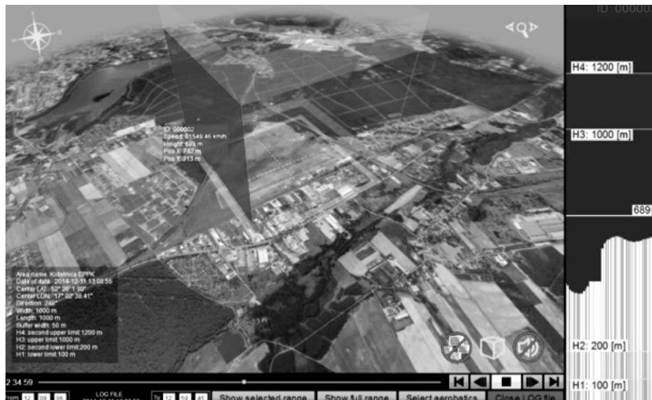
Fig. 1. Breaking the pilotage area

AeroSafetyShow Demonstrator+PL system is designated for monitoring aircraft's flight parameters. It provides data on the position, flight direction and flying speed, among others. One of functions that the ASSD+PL application offers is the possibility of creating so called 'box', i.e. the pilotage area. If the aircraft leaves this area, it is signalled acoustically and visually, as shown in Fig. 1. This system is used during air shows, aerobatic competitions and flight trainings as a tool allowing not only to control flight in real time but also to reproduce the course of the already-finished flight.